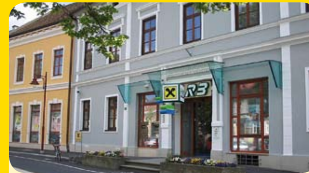
Raiffeisenbank Mureck – partnering local business.