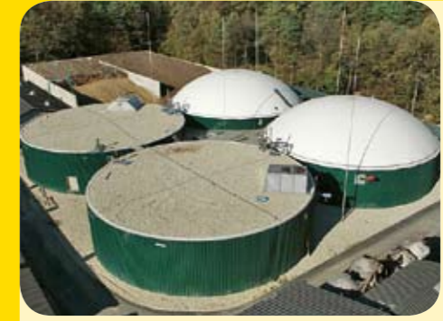
Building the special containers and silos for the biogas plant in Mureck

Raiffeisenbank Mureck Hauptplatz 8 8480 Mureck Telefon 03472/2025 Telefax 03472/2025-26 e-mail: info@rbmureck.at www.rbmureck.at