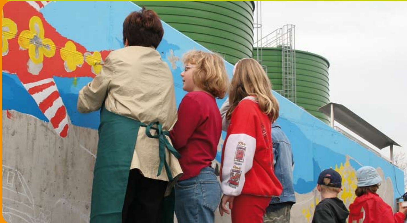
Awareness-raising already starts at primary school. Young pupils and children of kindergarten age embellish the walls of Bioenergie Mureck with their creativity.